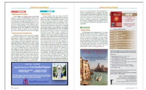
Above l-r: 1/3, 1/4, and 1/2 vertical ads. Below, two horizontal 1/2 pages.