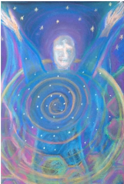
Speaking to the Stars Pastel on paper, 11 x 15 inches

An image for our project has been chosen and we hope it speaks to you as much as it does to us. We are delighted that this pastel drawing has been created by someone within our region specifically out of this project. Her inspiration and a bit about the artist follow.