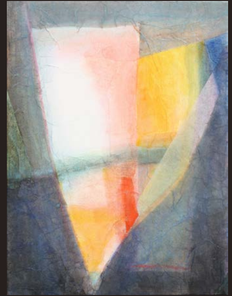
Mineral Nature, 2013