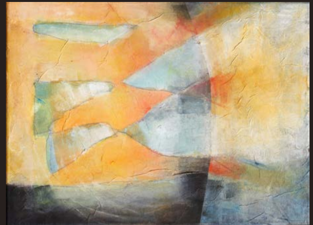
Old Moon, 2013