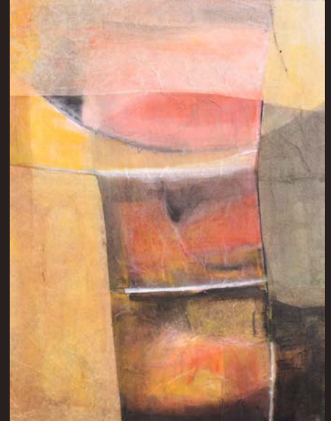
Spirit Nature, 2013