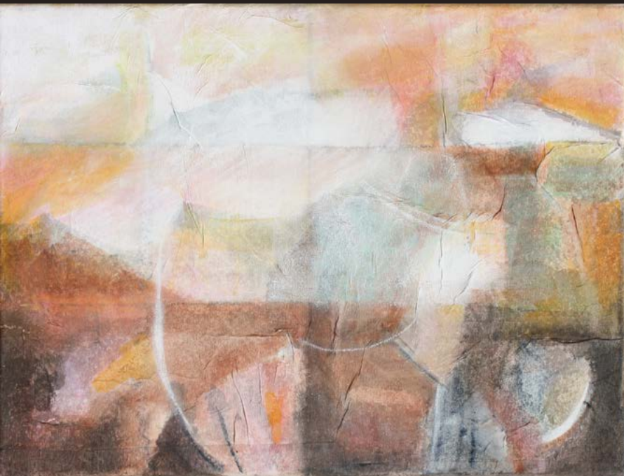
Animal Nature, 2013