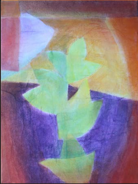
Plant Nature, 2013