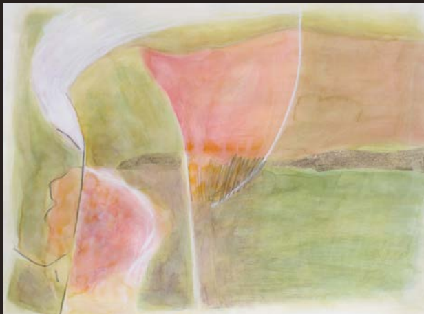
When Mountains Had Wings #1, 2012