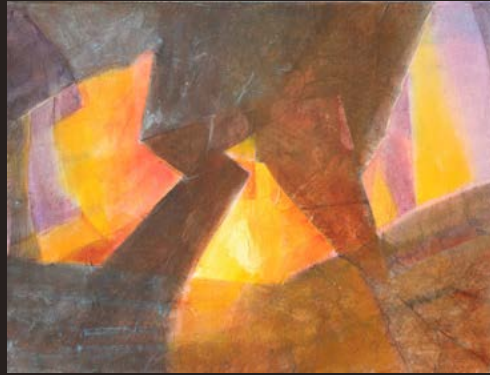
Dragon's Lair, 2013