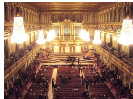
Musikverein, interior.