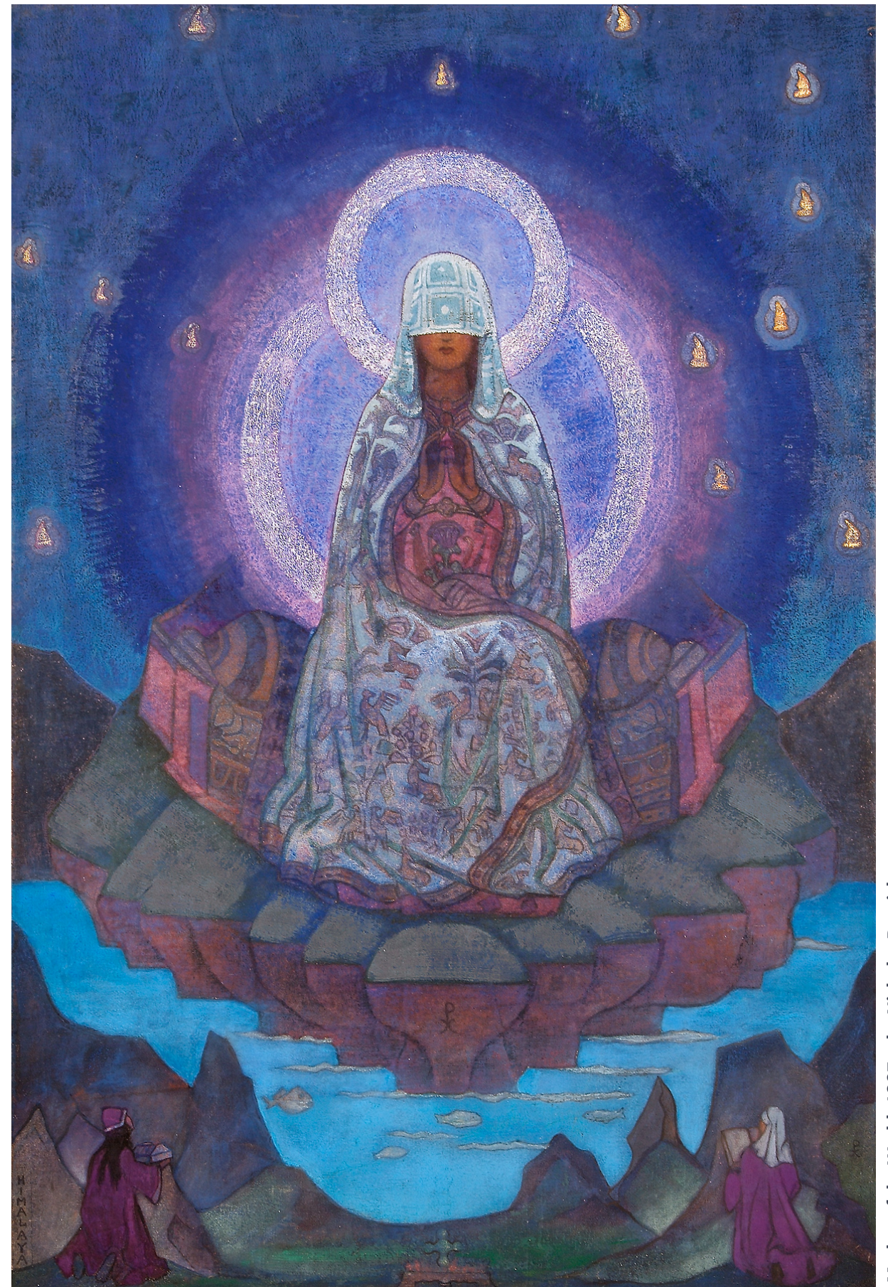
Mother of the World, 1937 • by Nicholas Roerich

"May my soul bloom in love for all existence." ~ R. Steiner