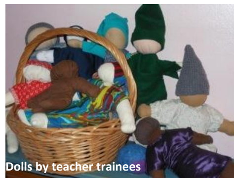
Dolls by teacher trainees

One of our trainees, AWS alumni, was already hired as first grade teacher at AWS last fall, and one other had a baby so stays at home now. Our most courageous trainee drives in from Houston every Saturday so he's on the road way before sunrise and long after sunset. It's a very special circumstance to have this extended family for support as we delve deeper and deeper into the marvels of Waldorf Education. It will be a grand celebration indeed when the course culminates in a little over a year from now. Some wonderful candidates will be ready to join a Waldorf classroom at schools that will be very lucky to hire such eager and dedicated teachers.