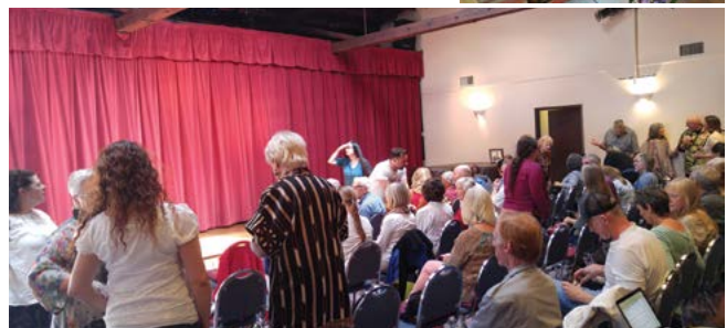
The LA Branch: at the door, reading room, meeting hall.