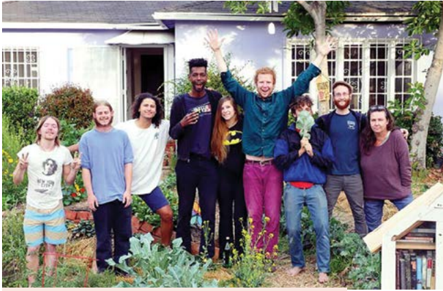
Above, Have Seeds Threefold House; below, Elderberries crew at the counter